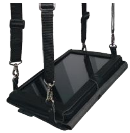
Harness Carrying Case